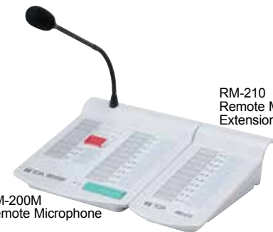
RM-210 Remote Microphone Extension Unit

These announcements can be made live or pre-recorded announcements can be activated. The remote microphone is connected by cable to the RM-210 Remote Microphone Extension unit.