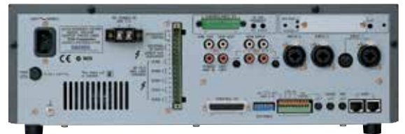
VM-2120 / VM-2240 Rear

The VM-2000 Series are designed with cost-effectiveness in mind, allowing for expansion as your needs grow. For instance, if the standard five loudspeaker zones are not enough, the unit can be linked to another unit for servicing an additional five zones and doubling the power output. The VM-2000 Series' cost-effectiveness allows installation to be basic at first, then expanded as particular requirements dictate. Optional accessories and related equipment are available to meet specific requirements and enhance a unit's operational scope. The VM-2000 Series conforms to most international emergency sound system standards and requirements such as IEC60849 (EN60849).