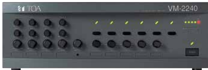
VM-2120: 120W System Management Amplifier