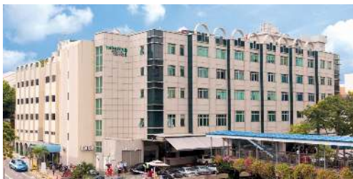
THOMPSON MEDICAL CENTRE