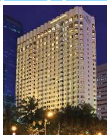
Manila Diamond Hotel