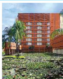
ITC Sheraton Hotel Mumbai