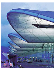
HK International Airport Terminal