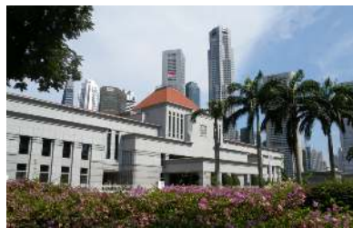
MINISTRY OF DEFENCE