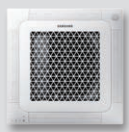
WindFree 4-Way Mini (600x600)